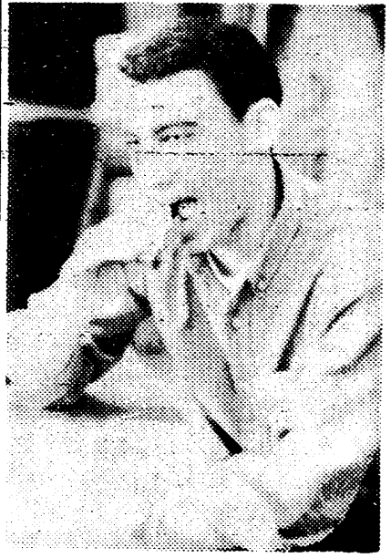
An unknowing student takes a bite of a tuna sandwich in the cafeteria.